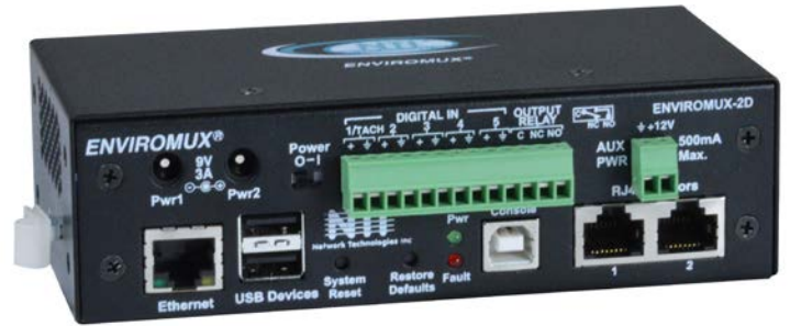
E-2D (Front & Back)